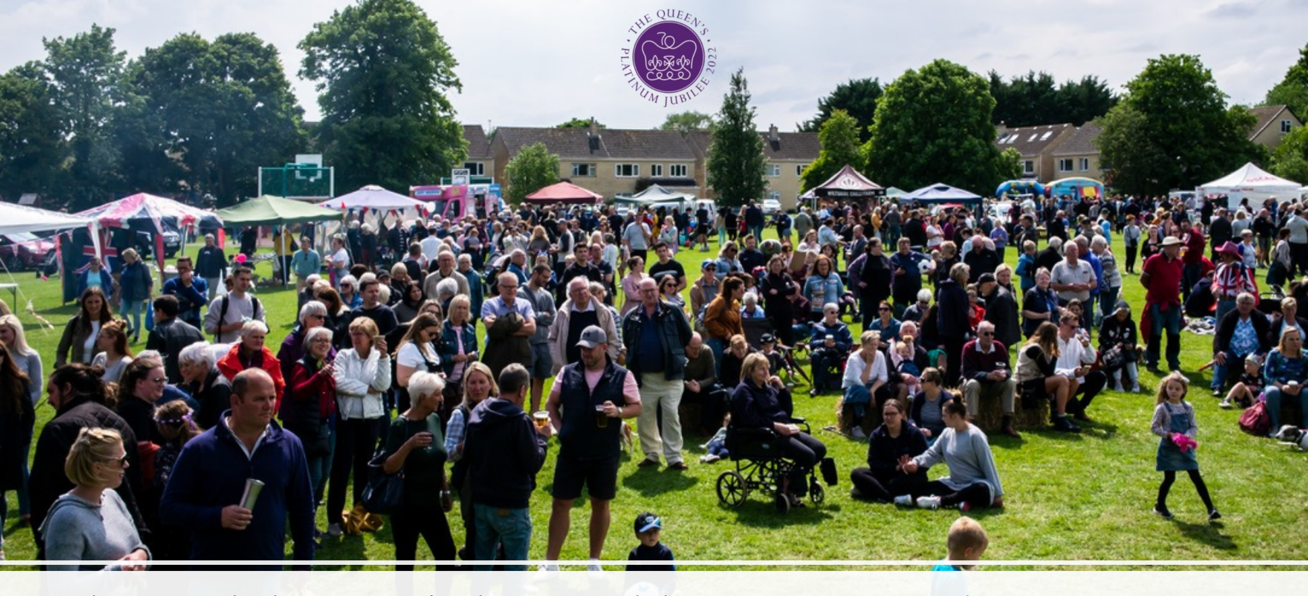
Shaw & Whitley Queen's Platinum Jubilee Fair – CAWS Update, 14 June 2022